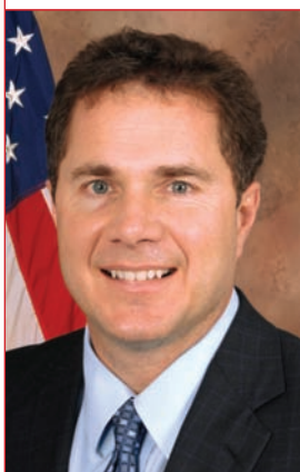
U.S. CONGRESSMAN Bruce Braley 1st Congressional District, Iowa